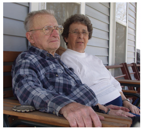
Rural citizens need to carefully review of Medicare Advantage plan as they may have trouble finding approved providers and rehabiliation services near their home.

A study in the Annal of Internal Medicine found that switching to Medicare Advantage was associated with increased financial burden among vulnerable populations, especially those with low incomes<sup>2</sup>.