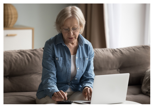
It's imperative senior citizens do their due diligence when selecting a health insurance plan. Your local health care providers can help.

At first glance, it may be easy to see the appealing parts of Medicare Advantage. Original Medicare includes Part A, for in-patient hospital